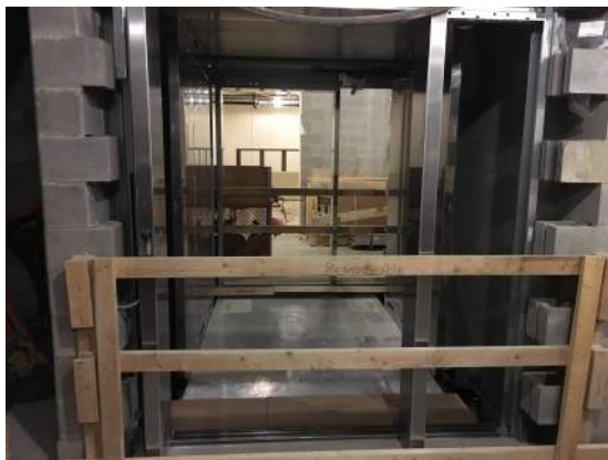
Elevator #2 Installation