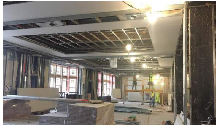
Drywall Chauffeured Ceiling 3rd Floor Area G