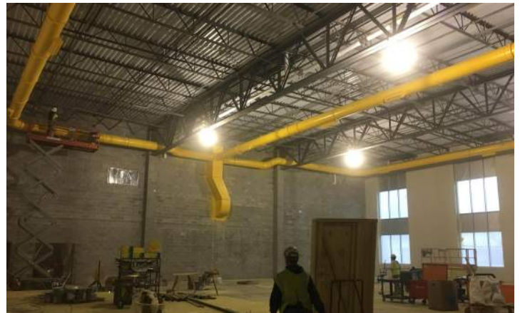
Painting Spiral Duct in Area C Auxiliary Gym