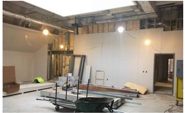
Drywall Installation in Area G Vocal Level